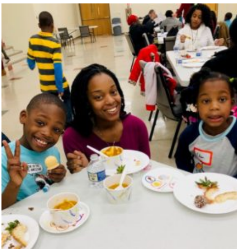
Photo from recent Family Engagement Night shows participants enjoying a healthy meal together.

The Healthy Families, Healthy Children program is empowering Howard County Head Start students and staff to live healthy lifestyles