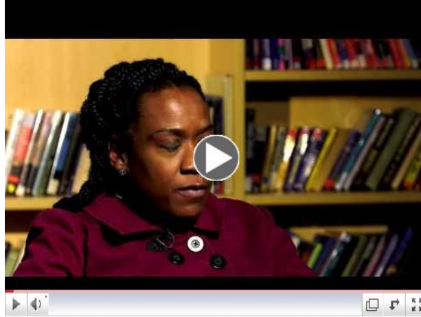
UCAP At A Glance!